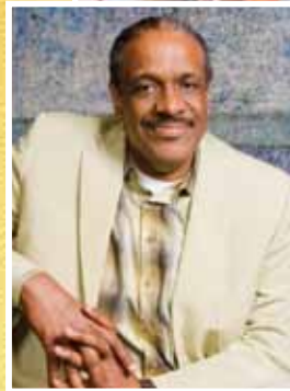
Christopher Paul Curtis

Immediately following the library's celebration, there will be a reception and book signing at the Flint Institute of Arts with Christopher Paul Curtis. Mr. Curtis is this year's Winegarden Visiting Professor at the University of Michigan-Flint. While you are there, take a free tour of the exhibits and an art studio class.